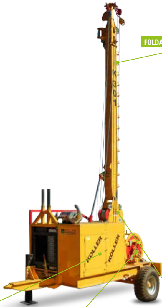
FOLDABLE TOWER (optional)