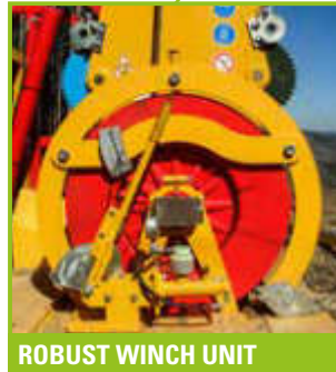
ROBUST WINCH UNIT